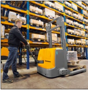
The EJC B14 at work