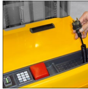
Integrated charger for convenient and, when required, quick charging of the battery at any mains socket