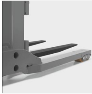
Support arm with patented tandem load wheels