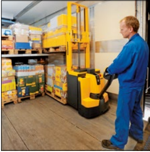
Double-deck lorry loading