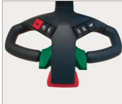
Multi-function tiller head