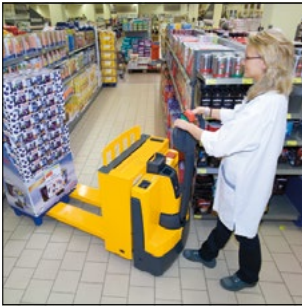
In operation in a store