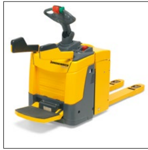
ERE 225 with foldable stand-on platform