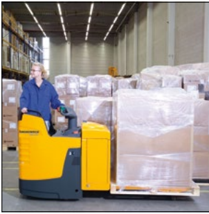
Travel in drive direction with the ERE 225