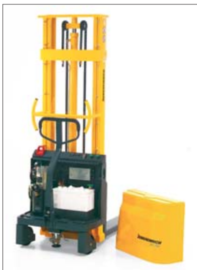
Easy access to all components