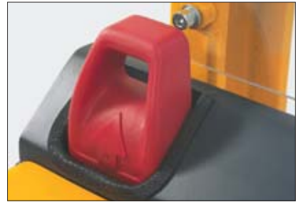
Easy access to emergency plug