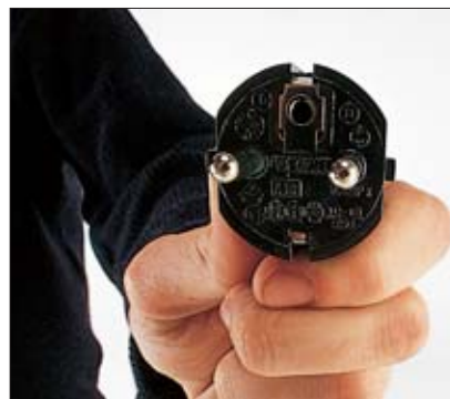
Simple plug in at any 230 V mains socket

The electro-hydraulic lift control and easy accessibility of lifting and lowering function keys facilitate precise positioning of the forks. All operating and display instruments are clearly arranged.